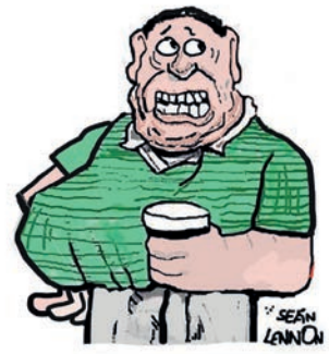
...whether we qualified or not is irrelevant, we choose to identify as a country that did."