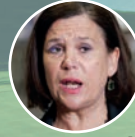
Mary Lou McDonald

"The media need to give him a break. Anyone can fall at the final hurdle!"