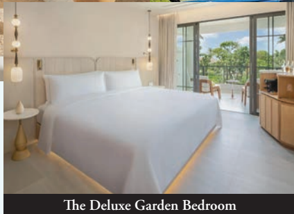
The Deluxe Garden Bedroom