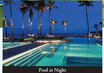
Pool at Night