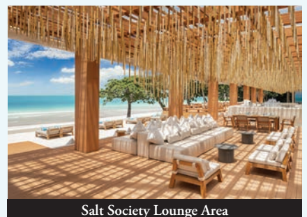
Salt Society Lounge Area