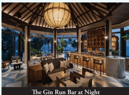
The Gin Run Bar at Night