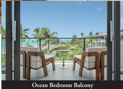
Ocean Bedroom Balcony