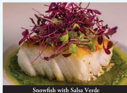
Snowfish with Salsa Verde