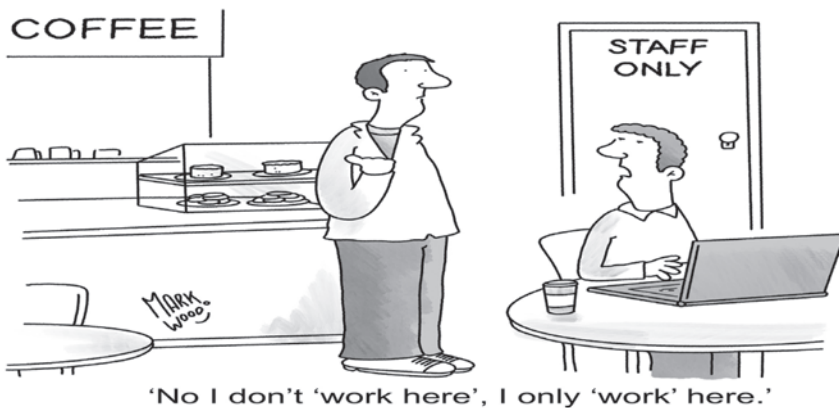
'No I don't 'work here', I only 'work' here.'

Please send suitable contributions to: The Hot Air Brigade, The Phoenix, 44 Lr Baggot St, Dublin 2 or email: hotair@thephoenix.ie