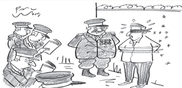
WE NO LONGER USE BULLETS, INSTEAD WE SHOWER YOU WITH HURTY WORDS