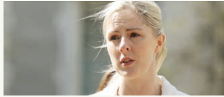
campaigns and gimmicky moves to make voting

"The fiasco was a complete success in that it reflected people power at its best," said Mr Varadkar. "The results show that ordinary people can decide for themselves about confusing