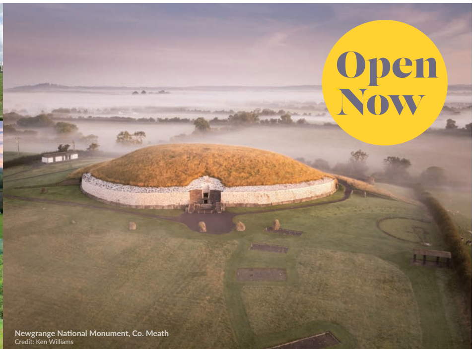
Newgrange National Monument, Co. Meath