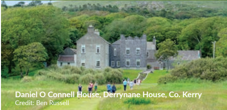
Daniel O'Connell House, Derrynane House, Co. Kerry