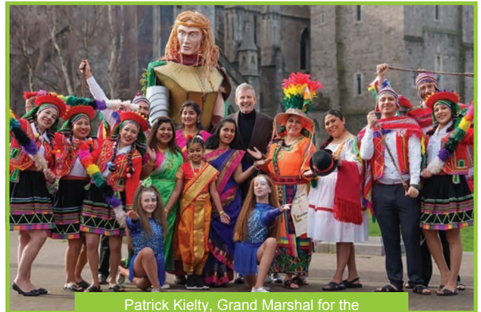
Patrick KIELTY, Grand Marshal for the National St Patrick's Day Parade 2024.