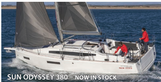
SUN ODYSSEY 380 – NOW IN STOCK