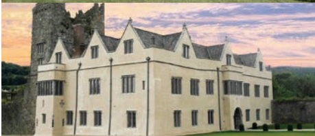
Ormond Castle, Co. Tipperary