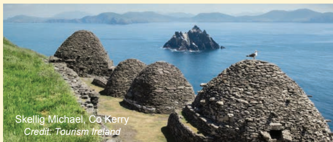
Skellig Michael, Co Kerry

Discover more at www.heritageireland.ie and embark on an unforgettable exploration of Ireland's heritage.