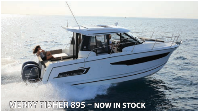
MERRY FISHER 895 – NOW IN STOCK