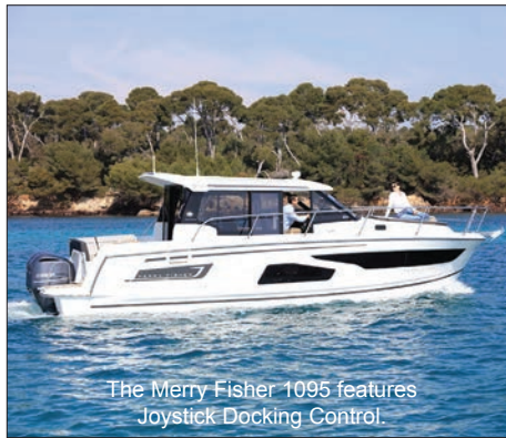
The Merry Fisher 1095 features Joystick Docking Control.

There are currently 52 models available in the sail boat, power boat and motor yacht category ranging from 5 metres to 20 metres catering for most people's tastes. With rapidly evolving technology in the marine industry,