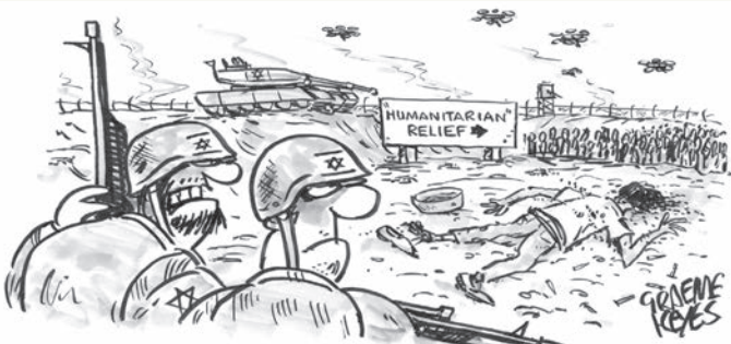
"HE WAS HEAVILY UNARMED!"