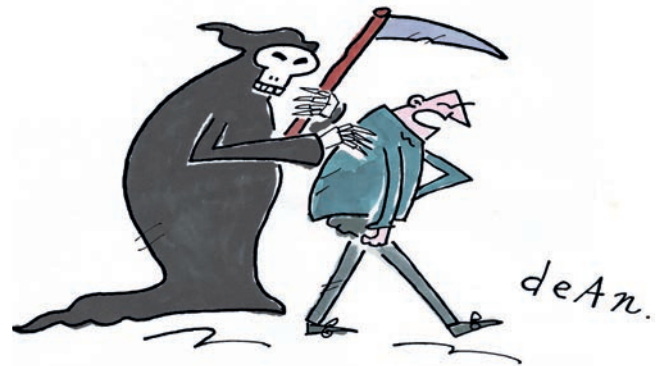
“Bugger! Forgot me phone”